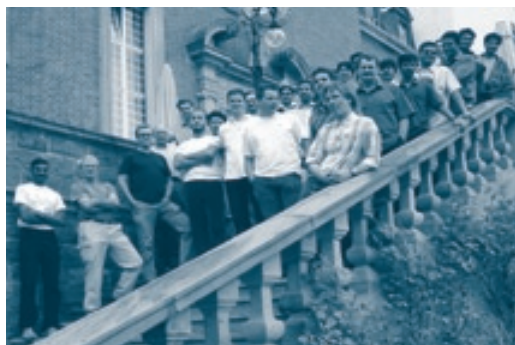
Students of the Master Program in Autonomous Systems and some of their mentors from Fraunhofer AIS in front of Birlinghoven Castle