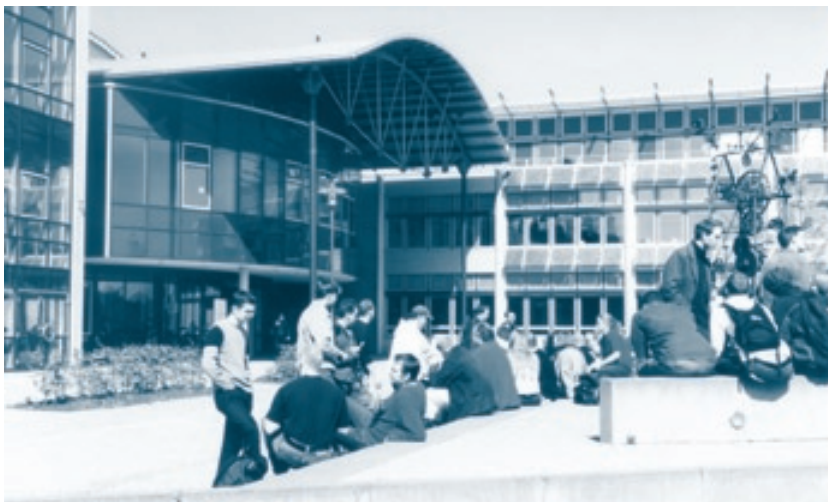
Campus of the Bonn-Rhein-Sieg University of Applied Sciences

In the field of autonomous robots, AIS develops sensor-based, robust wheel-driven and walking mobile robots. The institute is a leader in the research on sensor fusion of 3D laserscanner data for the exploration of unknown environments. In addition to supporting explorative tasks, robots can be valuable educational tools: They combine solutions from mechatronics, computer science, and electronics that are major elements of engineering curricula. Here, AIS provides its own robotic systems and related courses. Real-time simulation and control of non-linear systems, intelligent control systems as well as hard- and software integration round out the competence profile of the institute.