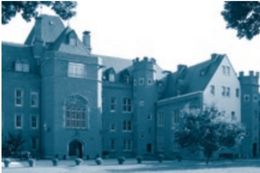
Entrance of Birlinghoven Castle

The Birlinghoven Castle campus has for almost 35 years been one of the largest and most influential computer science research sites in Germany. Since 2001, it is a member of the Fraunhofer Society of Applied Research. Today about 500 researchers work in the IZB institutes. That represents a quarter of the Fraunhofer ICT Group, Europe's largest IT research organization. The institutes collaborate closely with the European ERCIM network of national IT research centers as well as with leading research establishments in the USA, Eastern Europe and Asia. The campus also hosts one of the best-equipped Computer Science research libraries in Germany. Three IZB institutes contribute to the B-IT master programs Media Informatics and Life Science Informatics: