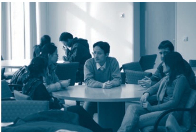
The B-IT cafeteria is an attractive place between classes

The B-IT building is situated in a large park overlooking the river Rhine. The building, the former 'embassy' of North Rhine-Westphalia to the German federal government, has office space for two large research groups, faculty coming in from Bonn and Aachen, several student computer rooms, five classrooms and six specialized student laboratories, plus numerous facilities for socializing and teamwork. It is located next to the former office of the German Federal Chancellor, now the Ministry of International Cooperation, and is embedded in an emerging network of United Nations institutions located in the southern part of Bonn, the former German capital and emerging science city. Bonn's famous 'Museum Mile' is just a couple of hundred meters away, the headquarters of companies such as Deutsche Telekom and Deutsche Post, but also the Federal IT Security Institute (BSI) are within walking distance. Students have, in addition, access to the library and computing facilities of the University of Bonn, the Fraunhofer Institute Center Birlinghoven Castle (where most lab courses continue to take place, about six kilometers away from the B-IT building), or even RWTH Aachen University.