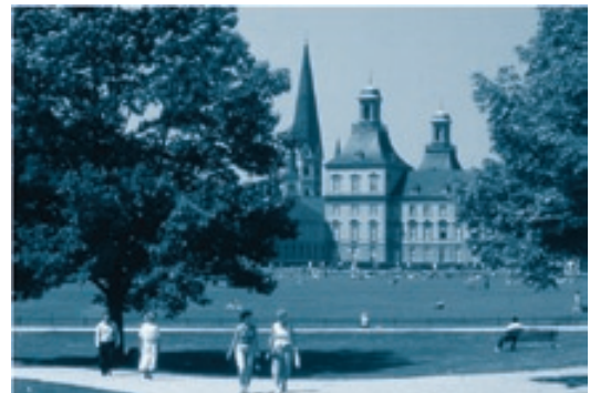
The spacious Hofgartenwiese is a major summer attraction on the University of Bonn campus

RWTH Aachen University was founded as a Polytechnic in 1870 with considerable support from local industry. In 1948 it was established as Rheinisch-Westfälische Technische Hochschule Aachen (RWTH), the Institute of Technology of the State of North Rhine-Westphalia. Today, RWTH is one of the most renowned technical universities in Europe, with around 30,000 students, of which more than the half are enrolled in engineering. More than 4,000 international students are enrolled, including around 900 Asian students. RWTH offers more than 65 first degree programs in Science, Engineering, Economics, Medicine and Arts and more than 20 graduate programs in Science and Engineering. The specific strength of RWTH’s engineering education is the combination of education and advanced research. RWTH’s engineering departments closely cooperate with national and international industries. Most of the engineering professors at RWTH held positions in industry before they became RWTH faculty members. The RWTH master programs educate engineers who are keen to engage in R & D, innovation, and entrepreneurship.