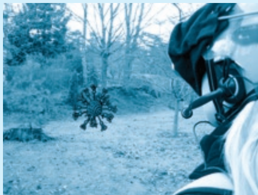
Student in an outdoor game created at Fraunhofer FIT

The students in the project created scenarios to work out the strategies of the game. Use cases showed the interaction of different role players with the system. Sequence diagrams were used to formalize the interactions as a basis for the functional specifications. A prototype using WLAN-based localization technology was developed and tested by a group of students on three floors of the Fraunhofer FIT building.