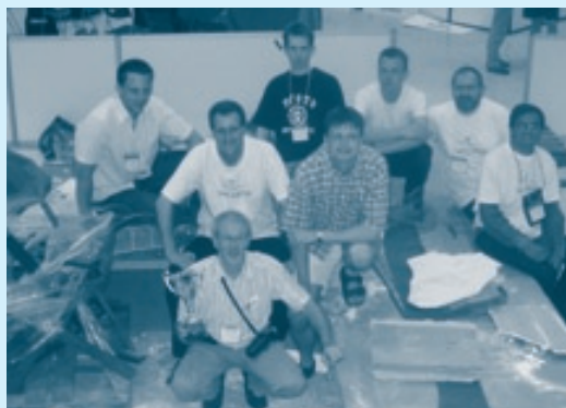
KURT3D is vice champion in Robot Rescue; B-IT students are in the team

The rescue team, which participated for the first time, fared much better. There was a keen competition mainly with Japanese teams during the first round and then with two Italian teams. KURT3D finished in second place. The vice champion excelled through its true 3D environment object model gained from an innovative implementation of the iterative closet point algorithm.