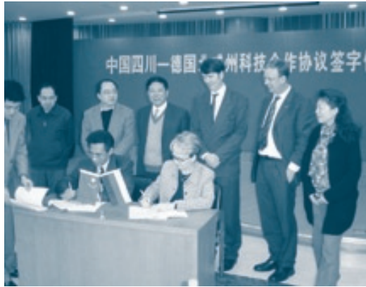
Minister Kraft signing the cooperation agreement with Jiangsu Province in Nanjing