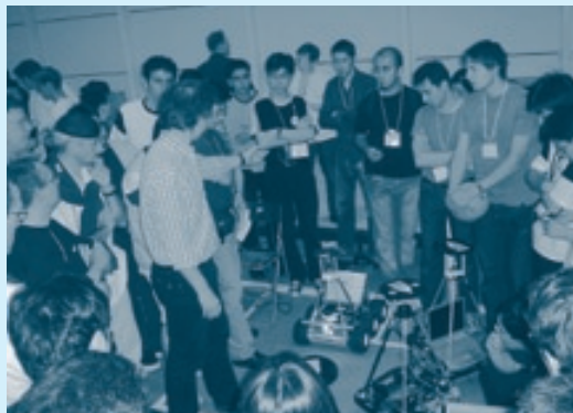
The AIS/B-IT team presents its robots in a RoboCup technical challenge

Our MSL team faced 6 other German teams, and international competitors came from Portugal (5), Japan (3), two from Italy, Netherlands and Iran, one from China and Austria. The first round went well by winning two games, drawing another two and losing just one. In the second round we won another game but lost two, thus we were out. Overall the team finished in 12 th place.