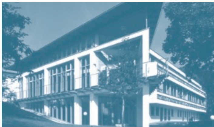
B-IT main building, overlooking the Rhine

An internationally competitive teaching institute such as B-IT requires strong international networking. In the spring of 2004, cooperation treaties of the NRW research ministry with its counterparts in NRW's two partner provinces Jiangsu and Sichuan in China were concluded. With a successful joint application with Edinburgh (UK) and Trento (Italy) in the new Erasmus-Mundus Program we also had a good start