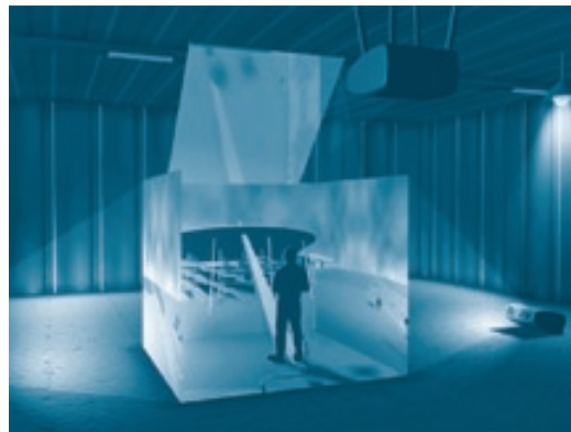
Advanced 3D projection technology at the Fraunhofer Institute for Media Communication IMK

The research and development activities of the Fraunhofer Institute for Media Communication IMK encompass all facets of the new media, including content design, production, distribution, and interaction. The key objectives of the IMK are to expand the range of potential and functionality of the new media, to study their creative and social possibilities, to develop innovative solutions and to open up new fields of application. Key topics are virtual environments, interactive TV, interface technologies, digital storytelling, management of multimedia content, web-based solutions and knowledge management.